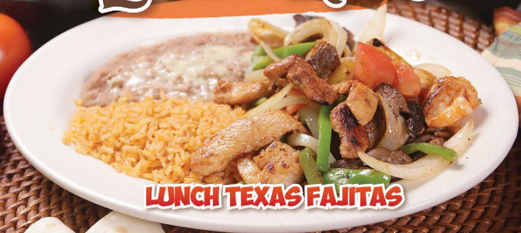
LUNCH TEXAS FAJITAS